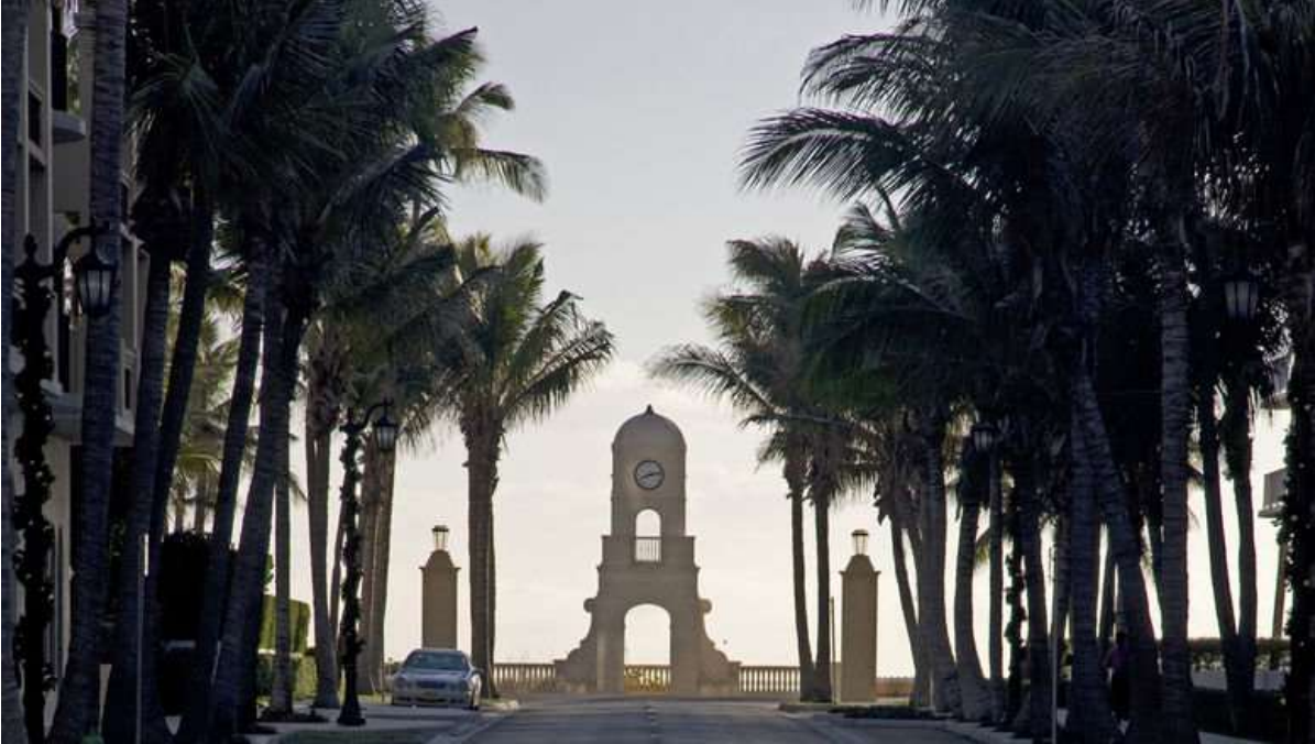
The clock tower marks the entrance to Worth Avenue

Over the decades, the avenue grew to three blocks, spanning from the Atlantic Intracoastal Waterway to the Atlantic Ocean. Over time, more and more well-known designers opened their doors along this strip of coveted real estate, including Cartier, Chanel, Gucci and Hermes. Most people do not know that Worth Avenue was actually established long before California's Rodeo Drive!